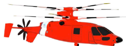
Search and Rescue